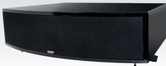
Model: Titan Theia