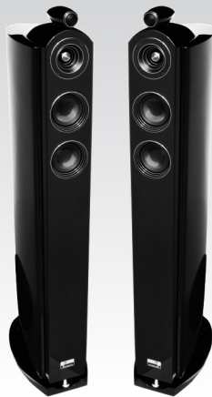
Model: Titan Telesto