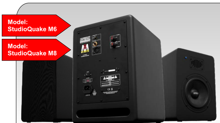
Model: StudioQuake M6