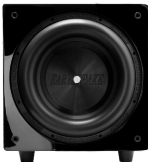
Patented SLAPS Technology